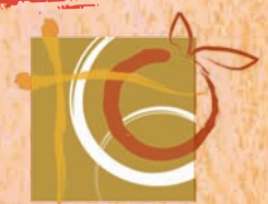
ORANGE CATHOLIC FOUNDATION

“ Do not neglect good deeds and generosity. God is pleased by sacrifice of that kind ” - Hebrews 13:16